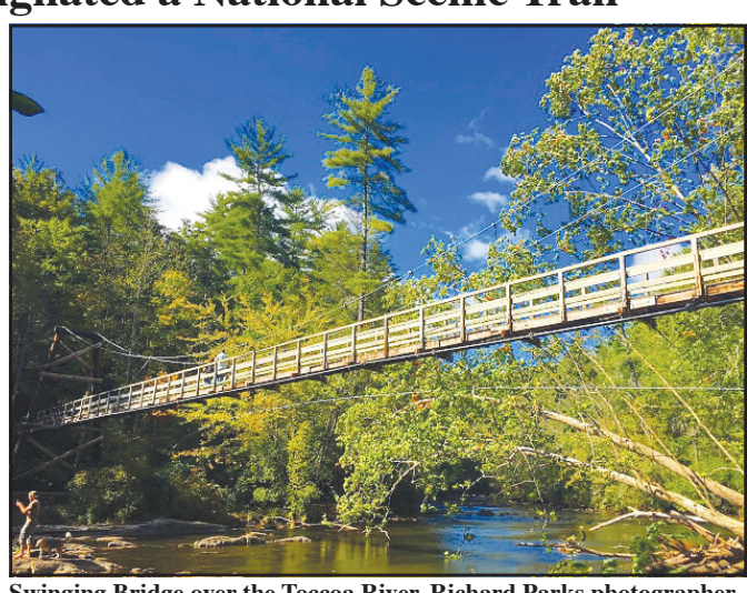
Swinging Bridge over the Toccoa River.